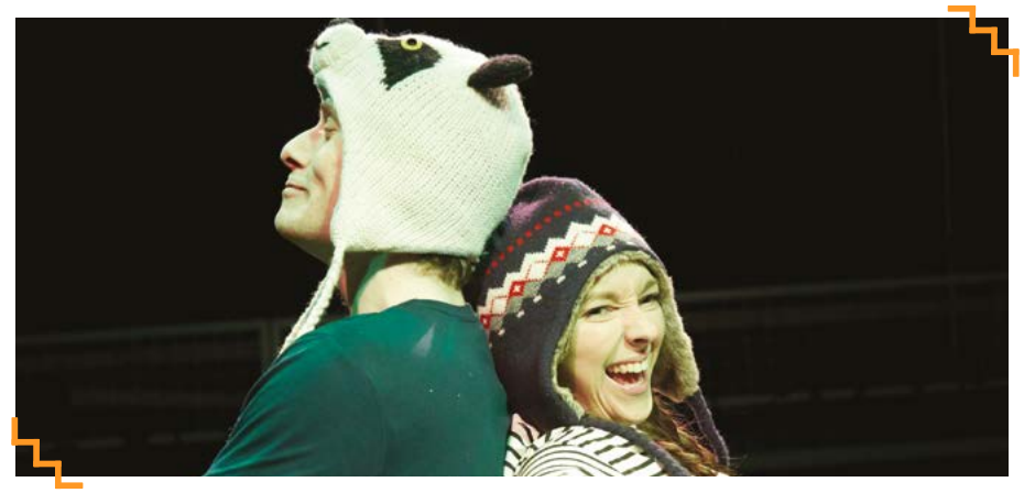
Theatre Company, Solo Performance, Multimedia Performance www.lpac.co.uk